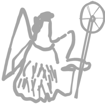
Lady Fortuna: Roman Goddess of Luck, Fortune or Fate

Unplug for a bit and let yourself drift: a wrong turn, a chance encounter, a change of plans. These are the kinds of moments you never optimise for, but tend to remember decades later.