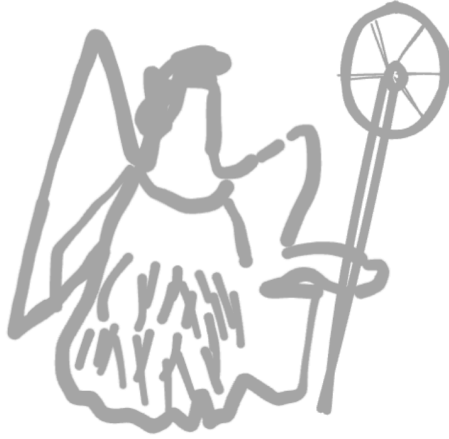
Lady Fortuna: Roman Goddess of Luck, Fortune or Fate