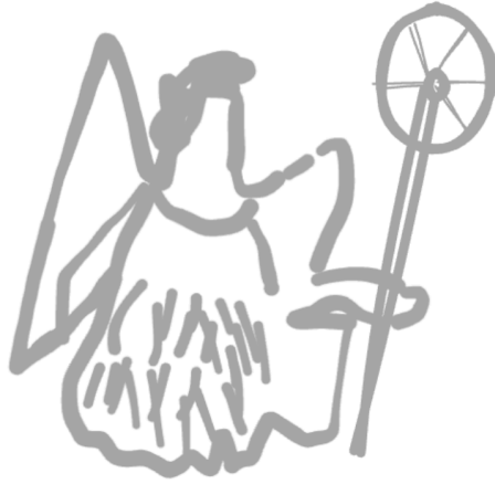
Lady Fortuna: Roman Goddess of Luck, Fortune or Fate