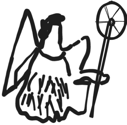
Lady Fortuna: Roman Goddess of Luck, Fortune or Fate