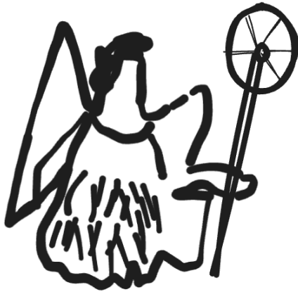
Lady Fortuna: Roman Goddess of Luck, Fortune or Fate

Unplug for a bit and let yourself drift: a wrong turn, a chance encounter, a change of plans. These are the kinds of moments you never optimise for, but tend to remember decades later.