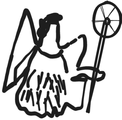
Lady Fortuna: Roman Goddess of Luck, Fortune or Fate