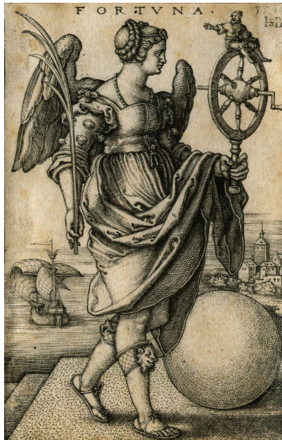
Figure 1: Lady Fortuna: Roman Goddess of Luck, Fortune or Fate

Unplug for a bit and let yourself drift: a wrong turn, a chance encounter, a change of plans. These are the kinds of moments you never optimize for, but tend to remember decades later.