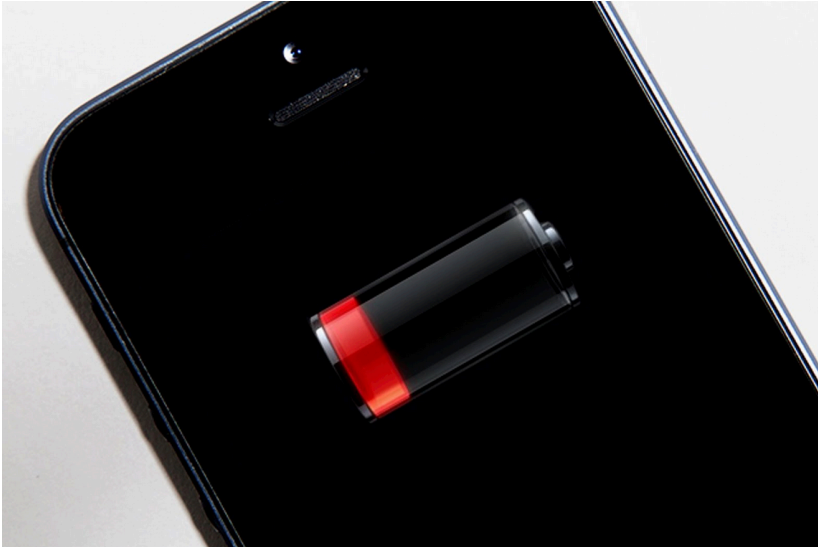
Figure 2: Smart phone: Dumb Choice?